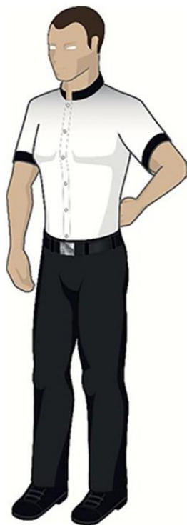
5. Hitting on the back