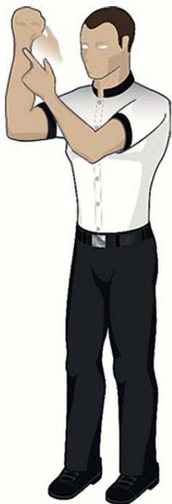
4. Hitting with an open glove