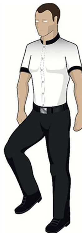
7. Kicking with the knee